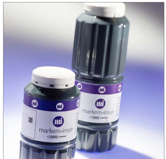
39,000 coded cartons with just one 1L ink bottle.

Choose between black or red for your porous packaging (cardboard, paper). Code will remain readable even in the toughest storage conditions.