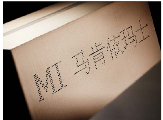
Multiple characters and logos in several languages.

Can be easily stored for weeks and restarted immediately (up to 3 months and without flushing).